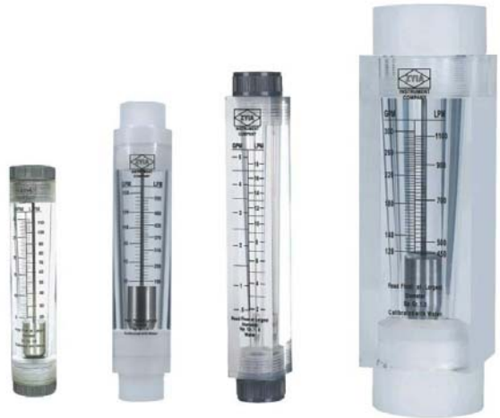
LZM-15 -25G LZM-50G LZM-40G LZM-75GF

Models: LZM-xxG Material: Body: Acrylic Float & Rod: Stainless Steel Adapter: PP Accuracy: ± 4 % Temperature: ≤ 60°C Pressure: ≤ 10 Bar (1 MPA)